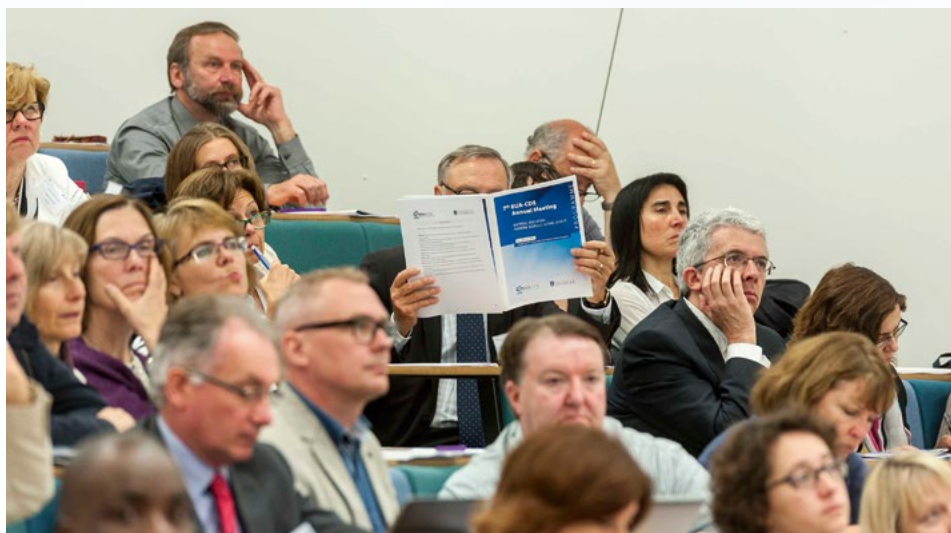
7th EUA-CDE Annual Meeting, University of Liverpool, United Kingdom