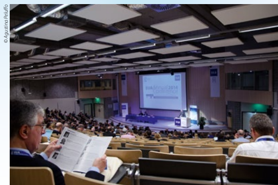
EUA Annual Conference 2014, Université Libre de Bruxelles (ULB), Belgium

In 2014, learning and teaching in European higher education continued to feature prominently on institutional and policy agendas. EUA’s Annual Conference on “Changing Landscapes in Learning and Teaching” provided a platform for intensive and productive discussions on global trends and transformations. Around 350 university leaders and higher education representatives gathered at the Université Libre de Bruxelles (ULB) on 3-4 April to debate topics including learning and teaching in the digital age as well as international dimensions of and European policy perspectives on learning and teaching.