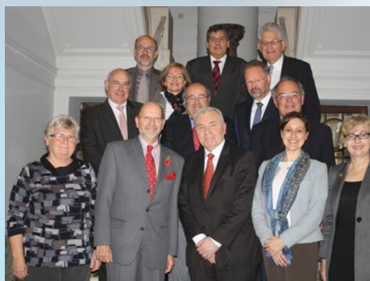
EUA Research Policy Working Group

in the development of Horizon 2020, the EU's research funding programme for the period 2014-2020. The association participated in all major stakeholder dialogues as the Horizon 2020 programme has taken shape, notably calling on policy makers to maximise the amount of funding allocated to Horizon 2020, given the importance of research and innovation for Europe's future competitiveness. EUA will continue to monitor Horizon 2020 during its implementation phase.