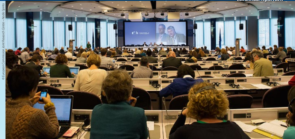
Mobilising Europe's Universities for Smart Specialisation Conference, Belgium

Smart Specialisation was also one of the core areas of EUA's work on research and innovation policy in 2014. In June EUA, together with the Joint Research Centre's (JRC) Smart Specialisation (S3) Platform and DG REGIO, convened a high-level conference on "Mobilising Europe's universities for Smart Specialisation", which brought together over 300 participants to discuss the role of universities in the definition and implementation of Smart Specialisation Strategies and share best practices.