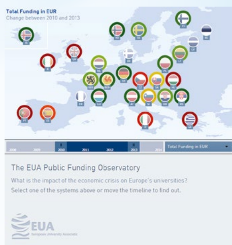
EUA Public Funding Observatory Tool

In October EUA also published the latest edition of its Public Funding Observatory. The Observatory's interactive tool was updated with new data and information, and four new higher education systems – Belgium-Flanders, Finland, Serbia and Slovenia – were included in the analysis for the first time, thus providing an even more comprehensive picture of the development of public funding for higher education in Europe. The published report highlighted a highly diverse situation with regard to public funding in higher education systems, and re-confirmed an increasing disparity between the highest and lowest funded systems in Europe and the development of a geographical divide in terms of investment in higher education. During the data collection, EUA's collective members also indicated that governments were often expecting universities to supplement shortfalls in national public funding with increased financial support from EU programmes, such as Horizon 2020.